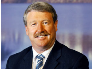
Message from Hon Bryan Green MP Minister for Energy & Resources

Tasmanian Minerals Council & Mineral Resources Tasmania Tasmanian Minerals Conference 2010