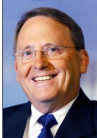
Message from Hon David Llewellyn MP Minister for Resources

Tasmanian Minerals Council & Mineral Resources Tasmania 2009 Exploration Group Forum